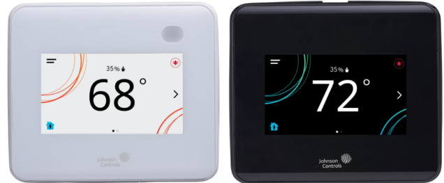
Figure 1: TEC3000 Color Series Thermostat shown with occupancy sensor in white and black enclosures

You can monitor and program the wireless and field-selectable BACnet MS/TP or N2 networked thermostats remotely through the building automation system, to provide efficient space temperature control. The wireless thermostats feature a connection to the ZFR Pro Series Wireless Field Bus Systems. All models include a USB port configuration that reduces installation time by allowing simple backup and restore features from a USB drive, which enables rapid cloning of configuration between like units. The programming memory of all TEC3000 Series Thermostats is non-volatile.